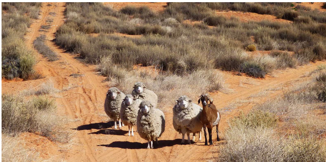
Livestock roam free on Navajo land, which receives between seven and 16 inches of rain per year on average.

"Every Indian water rights settlement protects the existing non-Indian users," he says. In general neighbors don't fear that tribes will develop infrastructure and take some of their water because they know that tribes don't have the money—but the settlements give them that money. "States say, 'We will help you get funding, but in return, we need to protect non-Indians because they're operating under the assumption that tribal water development isn't going to occur. Now we're developing it.' "