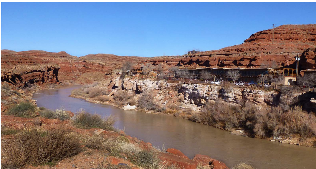
Running through much of the Navajo reservation, the San Juan River in Mexican Hat, Utah, is one of the most contested water sources in the West.

In January the Navajo Nation Council passed the latest such deal, with Utah, which will bring the Nation's Utah chapters water and $192 million to build pipelines, water treatment facilities, and irrigation systems. Some Navajo support the settlements, seeing them as a crucible they must pass through to gain economic growth and a better quality of life, and Navajo in New Mexico have already seen benefits from their deal with that state. Others feel they are giving up too much, and the settlements will cut off the Navajo Nation from water it will need to sustain itself in what climate change models predict will be much drier years to come.