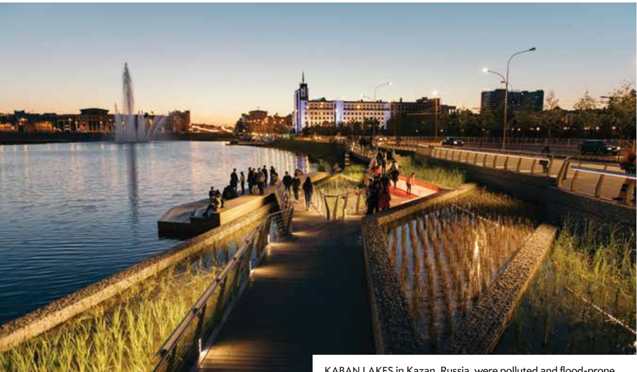
KABAN LAKES in Kazan, Russia, were polluted and flood-prone. Now their redesigned banks absorb and clean urban runoff.