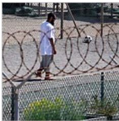
Closing Guantánamo Fades as a Priority