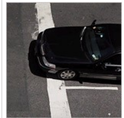
Two Fixtures of City Streets Discontinued