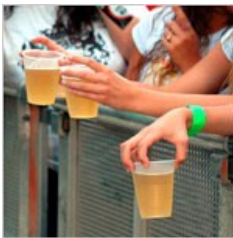
Room for Debate: Teen Drinking Diaries