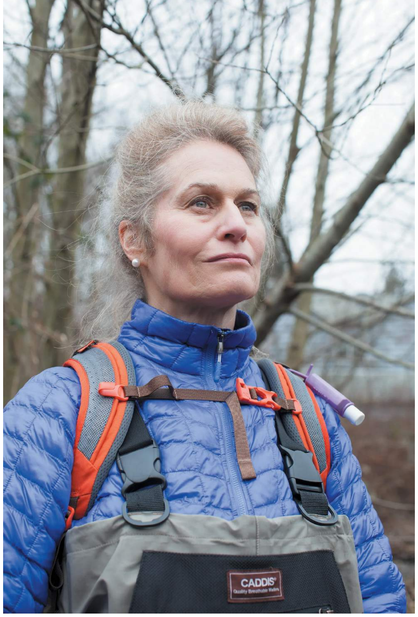
Lynch's vision has brought salmon back to Seattle's most degraded creek and reduced urban flooding.