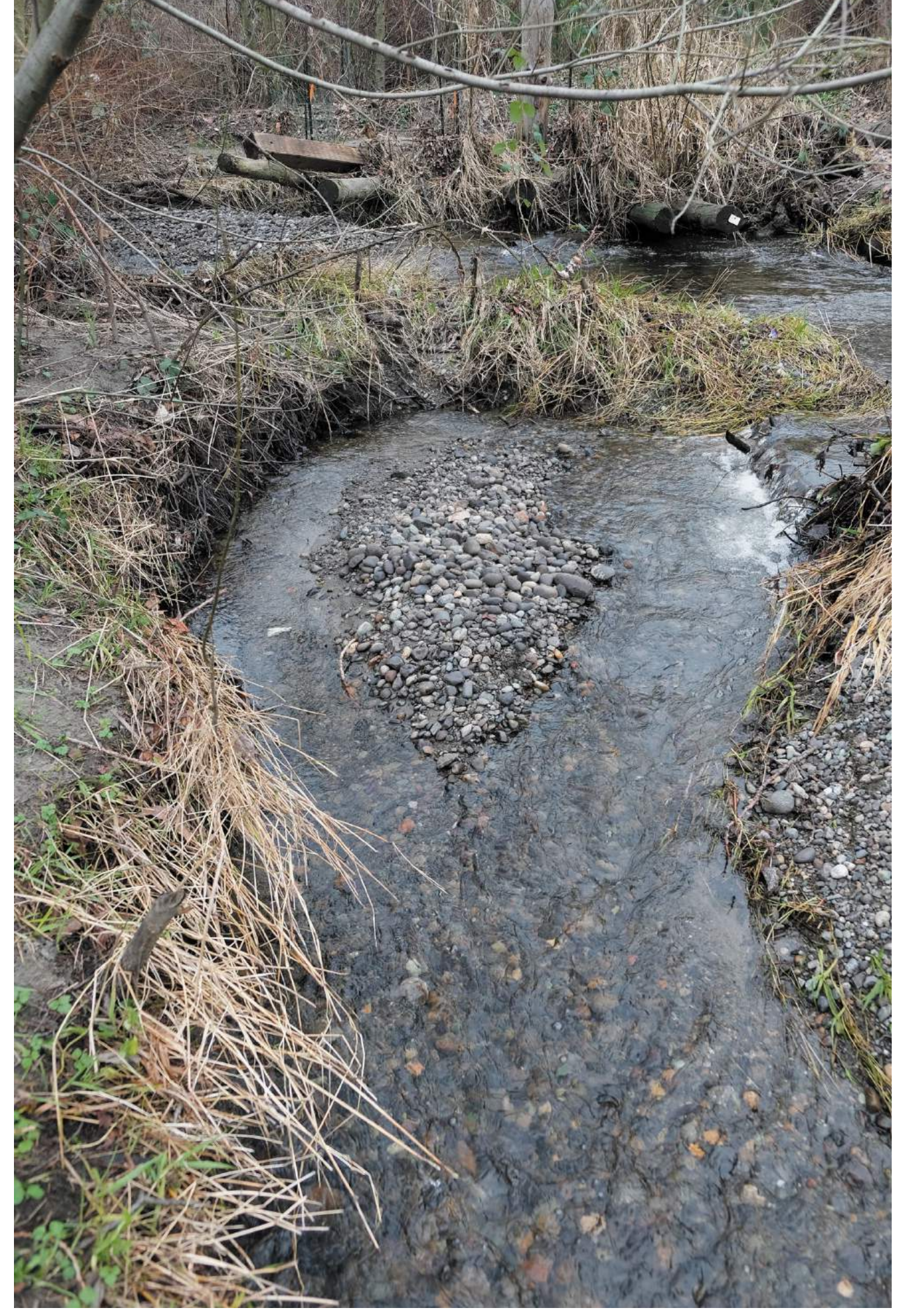
Bending the creek has slowed stormwater flow, safeguarding tiny creatures in the wet hyporheic layer underlying the stone bed so they can keep the water oxygenated and healthy.