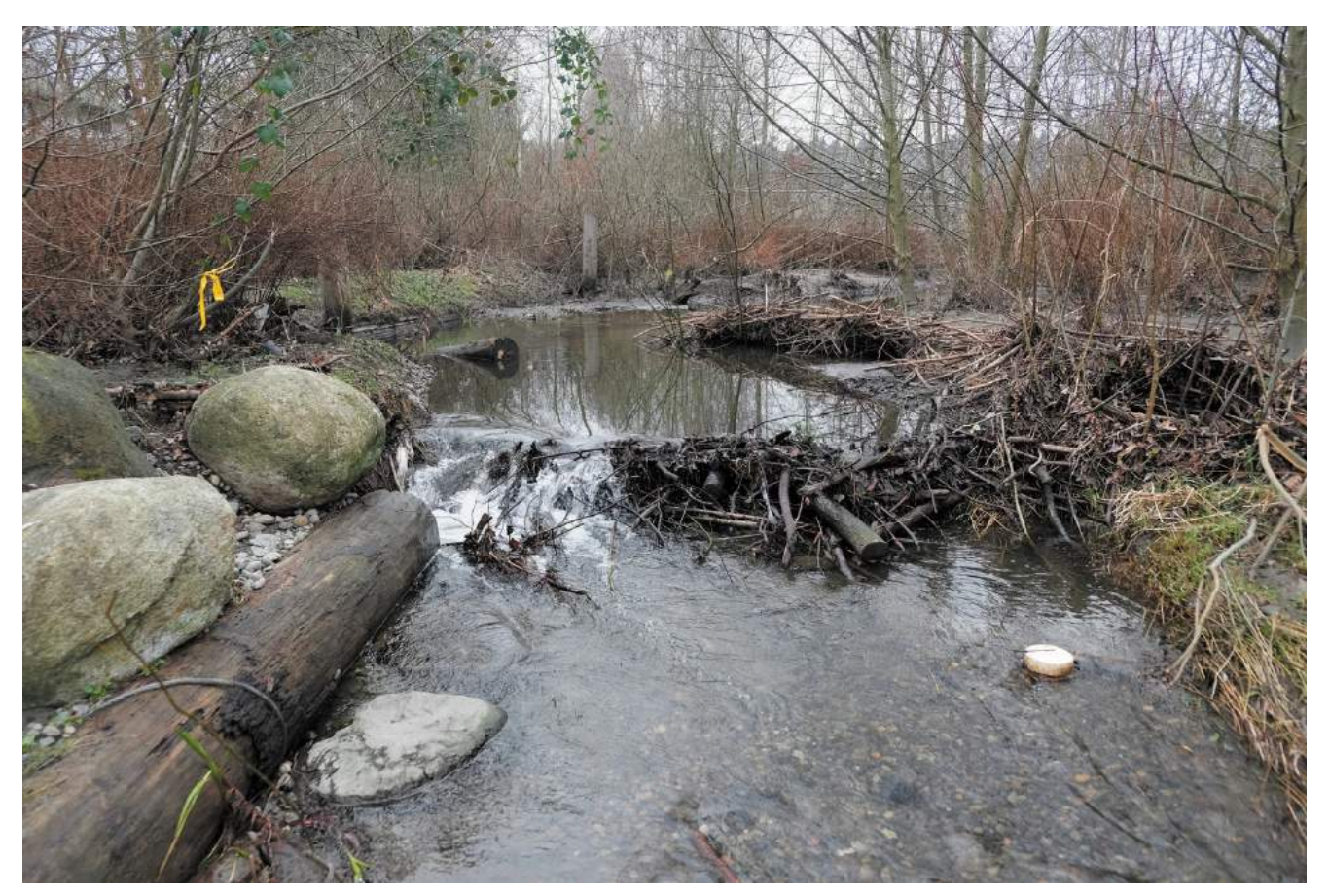
Boulders and tree trunks inserted into Thornton Creek create protective eddies for fish and bugs. They push water down into the hyporheic zone, where it can be cleansed of pollutants before reemerging downstream. Beavers have returned close to a city neighborhood in the background.

Hrachovec says it is "jaw-dropping" that such short hyporheic spans were able to reduce so much pollution. He adds it was "astounding to contemplate how much good we could do if we had this more available."