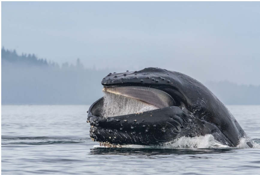
Humpback whale off the coast of British Columbia, Canada.