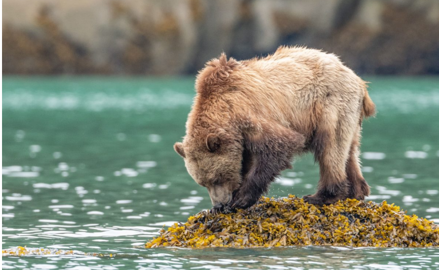
Grizzly bear in British Columbia, Canada.