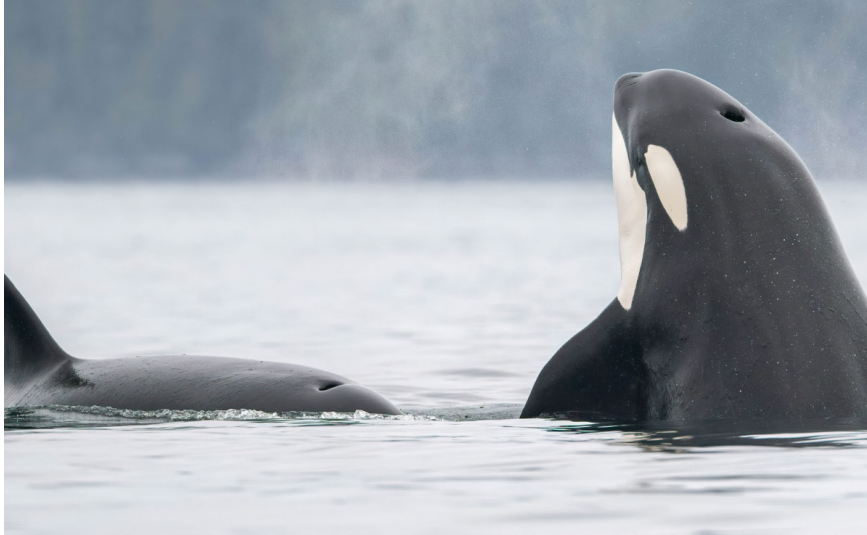
Orcas off the coast of British Columbia, Canada.