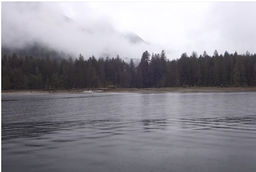
Mamalilkulla First Nation territory on British Columbia's Central Coast, some 350 kilometers (220 miles) north of Vancouver.