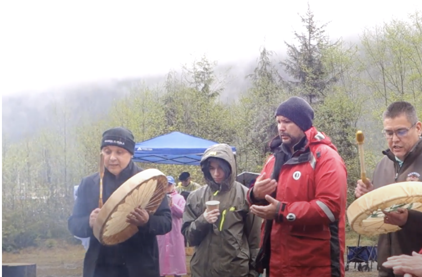
Mamalilikulla First Nation shared lunch with guests and performed traditional songs and dances in their remote territory on British Columbia's Central Coast.

Many Indigenous worldviews instead look at the ecosystem holistically, focusing on the relationships among water and rock, plants and animals — including humans, who they understand to be part of nature.